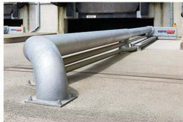
Easy to install above ground.

the COMBILOK. In addition an external red/green traffic light ensures clear visual communication to the driver. The driver will only receive the green light to drive away once the wheel restraint has been fully retracted.