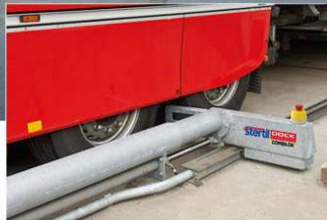
No damage to mudguards or side skirts due to the low height of the wheel block.