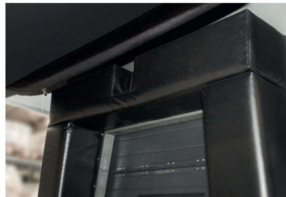
Special recess for cameras