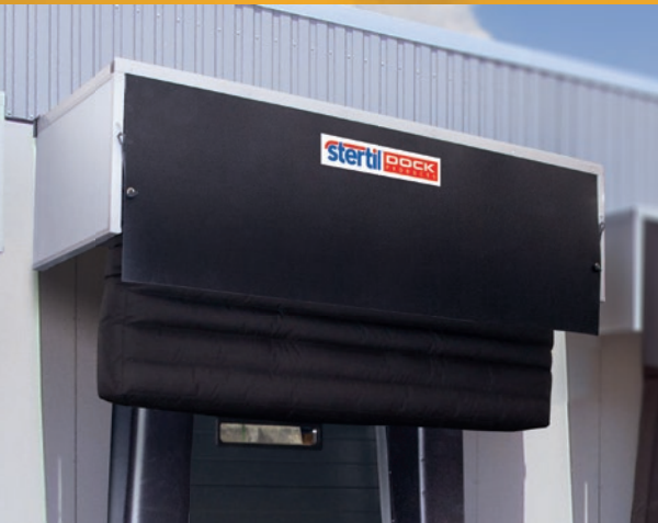
Inflatable top cushion for smaller sized vans