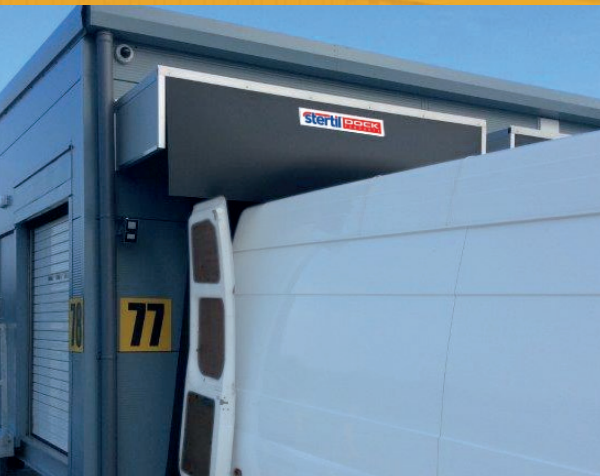
Special WSTP roof against wind and rain